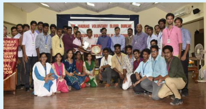
NSS Blood Donation Awards 2018 (500 + Donor in Single Day)