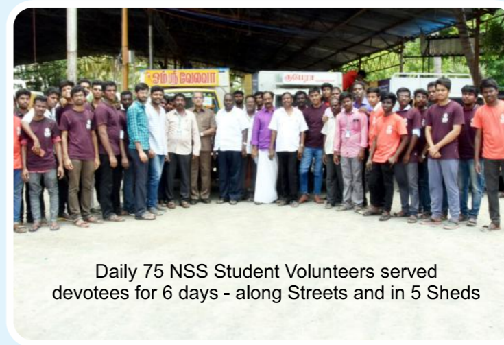
Daily 75 NSS Student Volunteers served devotees for 6 days - along Streets and in 5 Sheds