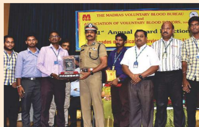
NSS Blood Donation Awards