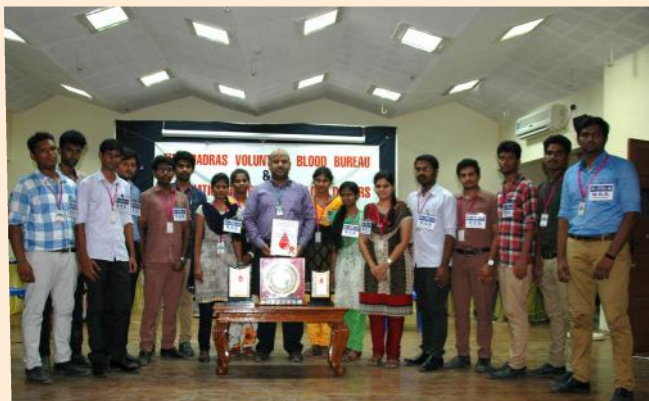
NSS Blood Donation Awards 2018 (500 + Donor in Single Day)