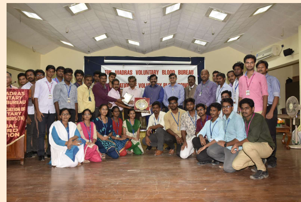
NSS Blood Donation Awards 2018 (500 + Donor in Single Day)