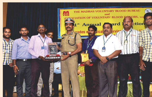
NSS Blood Donation Awards